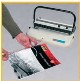
Insertion of the wire.